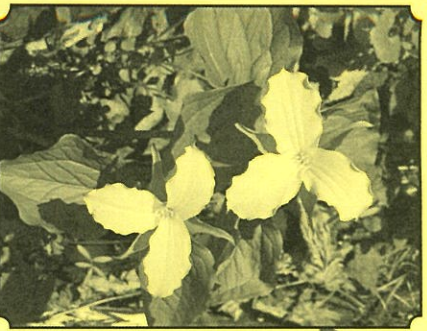
Trillium in bloom