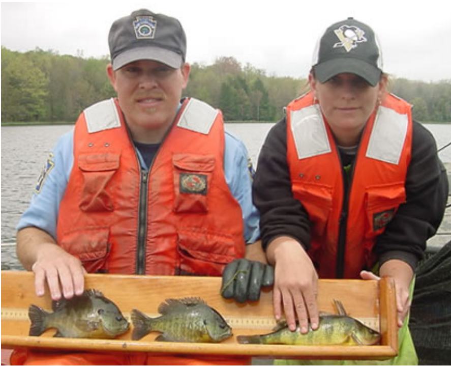
More Hemlock Lake panfish

Straight Run Lake is set in beautiful surroundings and provides the opportunity to harvest a few panfish and catch some largemouth bass and northern pike. Anglers wanting to avoid crowds and willing to get off the main roads should enjoy fishing this lake.