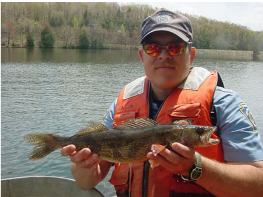
Hemlock Lake saugeye

We captured 2 saugeye at 18 and 19 inches in length. This low capture rate suggests we need to switch to stocking more readily available walleye fingerling to build a more reliable/dense walleye population that anglers will target.