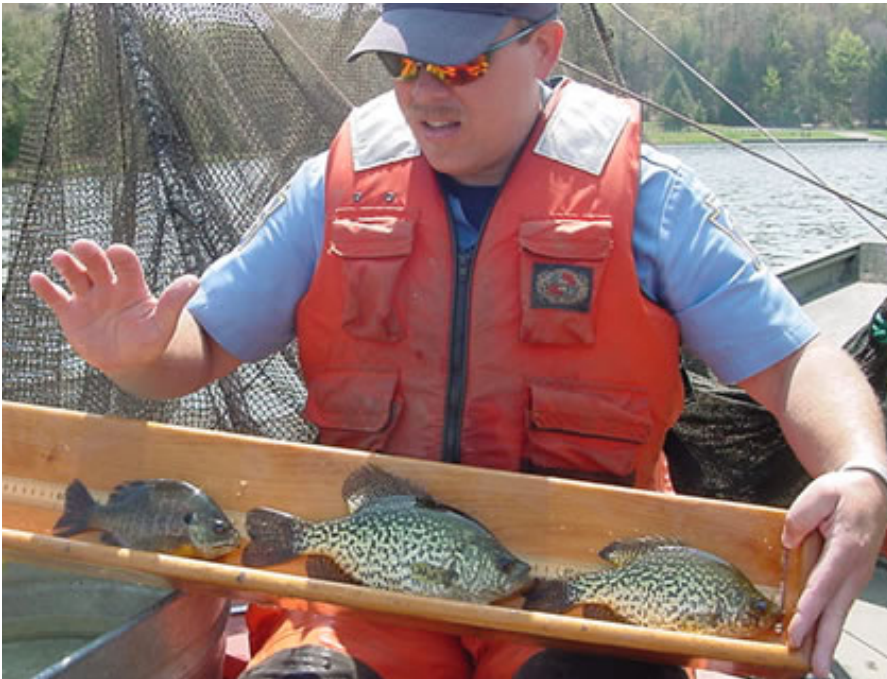
Hemlock Lake panfish

populations reflect the small size and infertile nature of Straight Run Lake. Large gamefish include largemouth bass, northern pike and saugeye. The panfish fishery consists primarily of black crappies, bluegills, pumpkinseeds and brown bullheads plus a few rock bass and yellow perch. Other species captured consisted of golden shiners and white suckers.